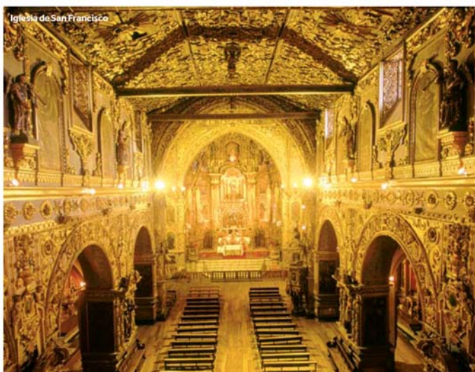
Iglesia de San Francisco

'We found ourselves awed by the abundance of sacred images. There must be literally acres of gold leaf here'