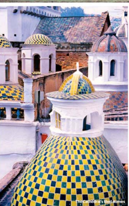
The Cathedral's tiled domes